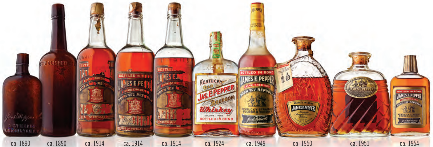
ca. 1890 ca. 1890 ca. 1914 ca. 1914 ca. 1914 ca. 1924 ca. 1949 ca. 1950 ca. 1951 ca. 1954