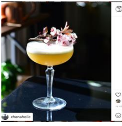
@cocktails.of.the.world Apr' 21