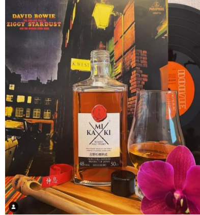
Apr' 21