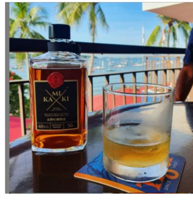
@chikidichoy May' 21